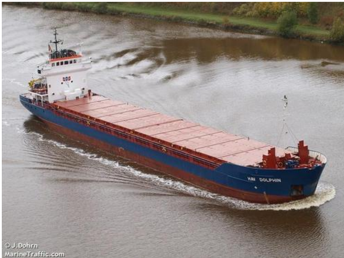
Figure 1: Fri Dolphin